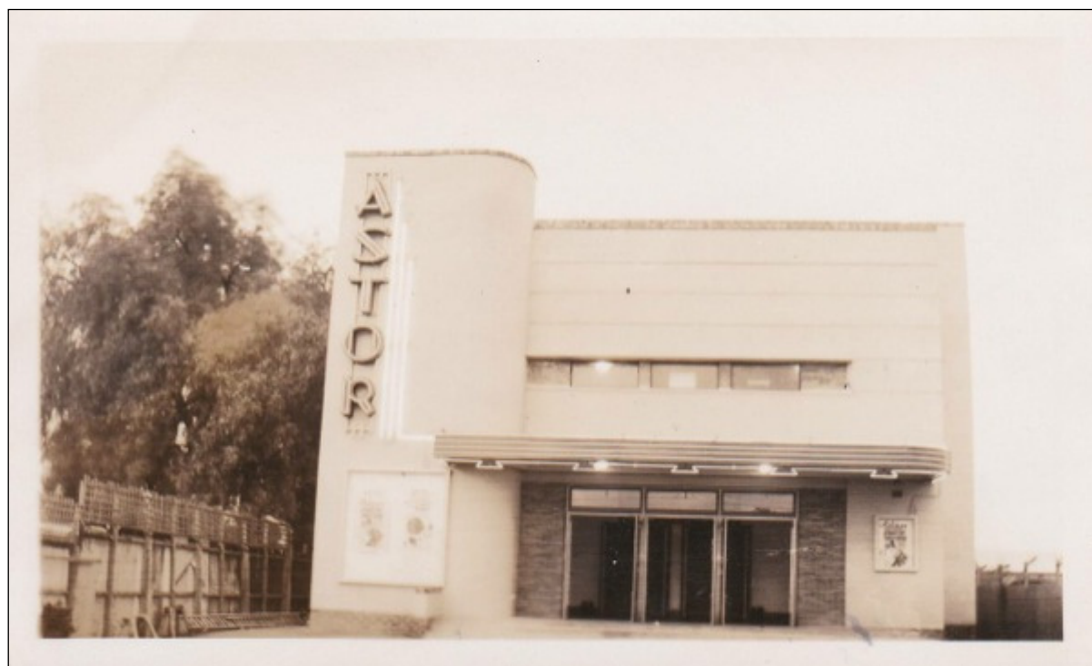
Astor Theatre—Shepparton 1938