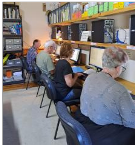
Wednesday research at the SFHG

A 94 year old spinster whose handwritten funeral instructions read " There will be no male pallbearers . Since they wouldn't take me out when I was alive, I don't want them to take me out when I am dead."