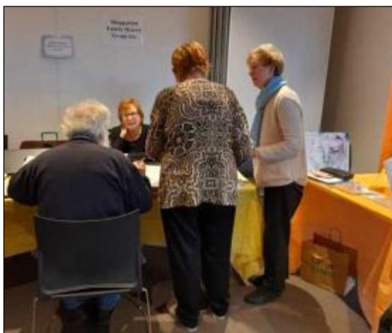
Interested researchers at the Prahran Mechanics

Several books were sold and one person joined our